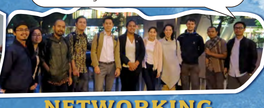
NETWORKING with Participants and People We Visit

Great opportunity to be connected to people on the ground or with similar interest