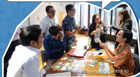
DISCUSSION with Professionals

Professional facilitation ("2030 SDGs Game" and "LEGO® SERIOUS PLAY®")