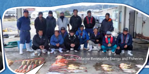
Hear stories directly from local government and stakeholders such as fishermen's association, energy company, etc.

Great opportunity to be connected to people on the ground or with similar interest