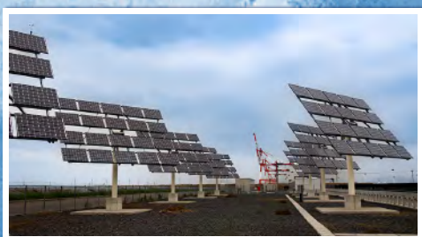
Solar tracking panels (Moving device according to the sun's location)